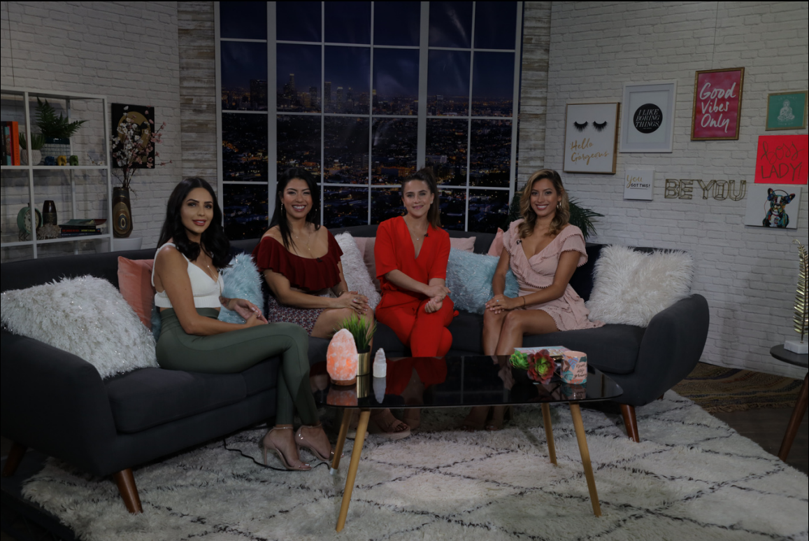
Talk Show Set 3