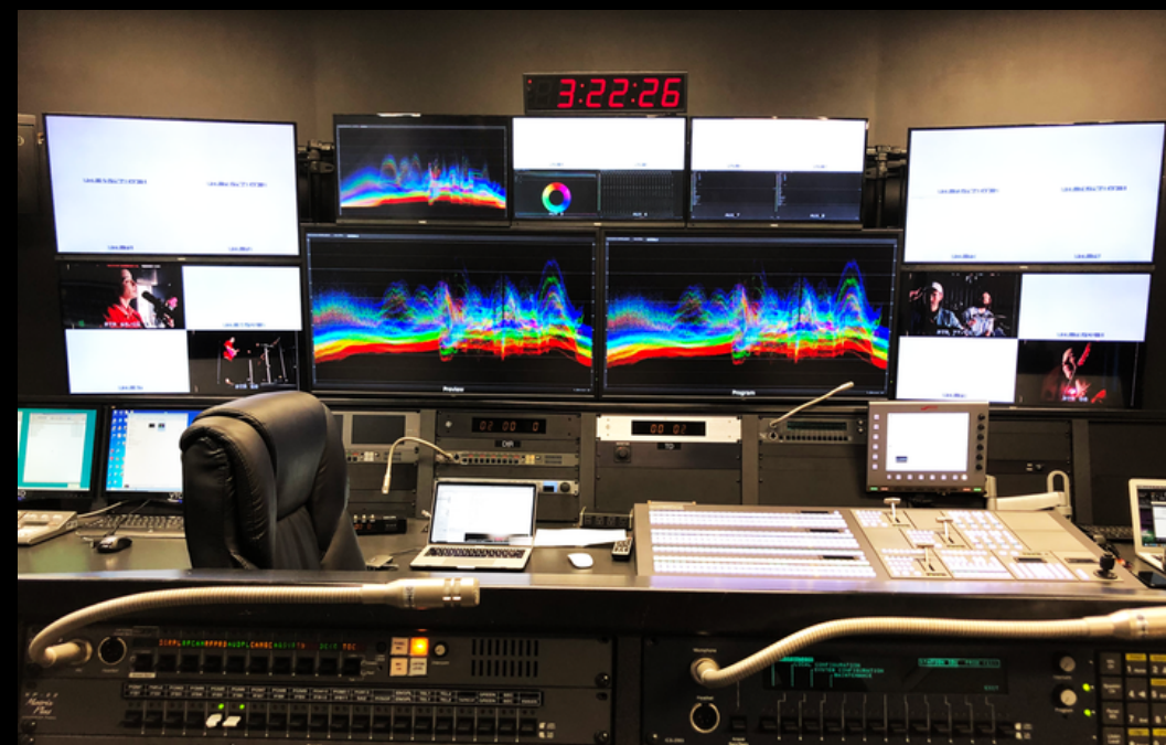
HD Control Room (PCR1)