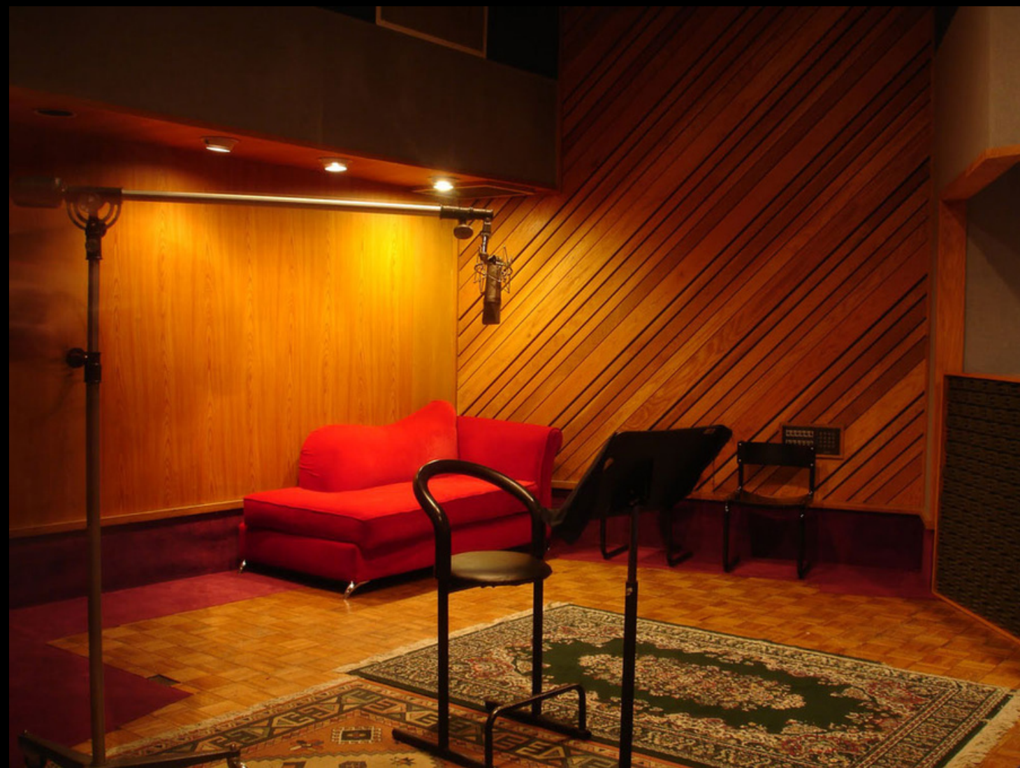
ADR & VOICE OVER ACOUSTICALLY TUNED