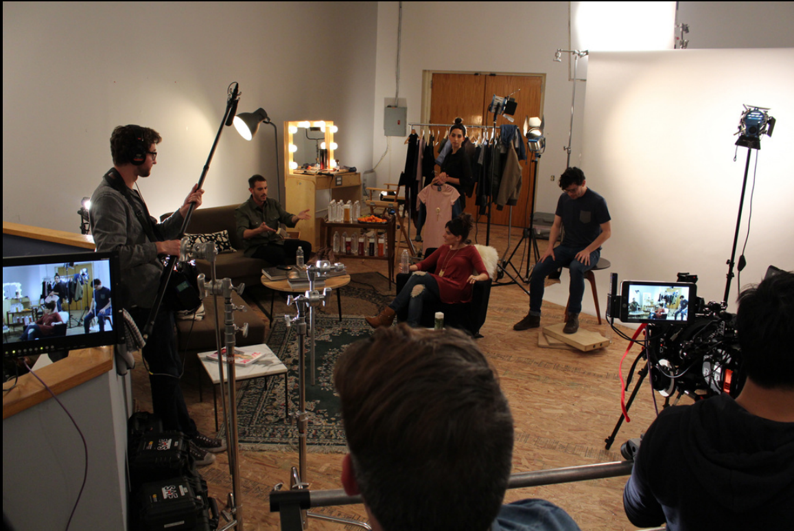
Film Set 1