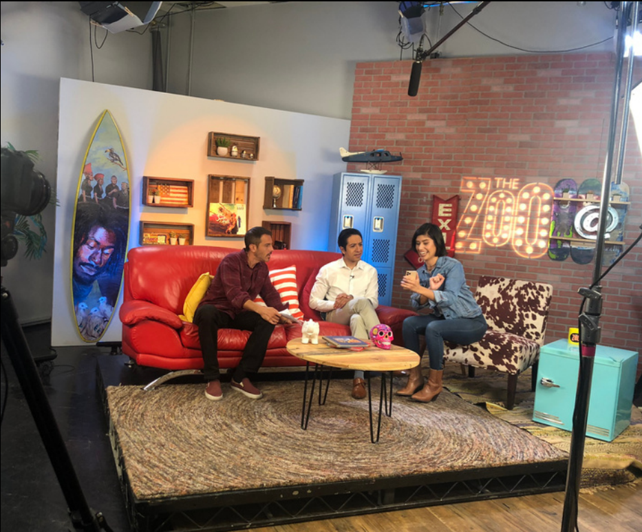
Interview Set 2