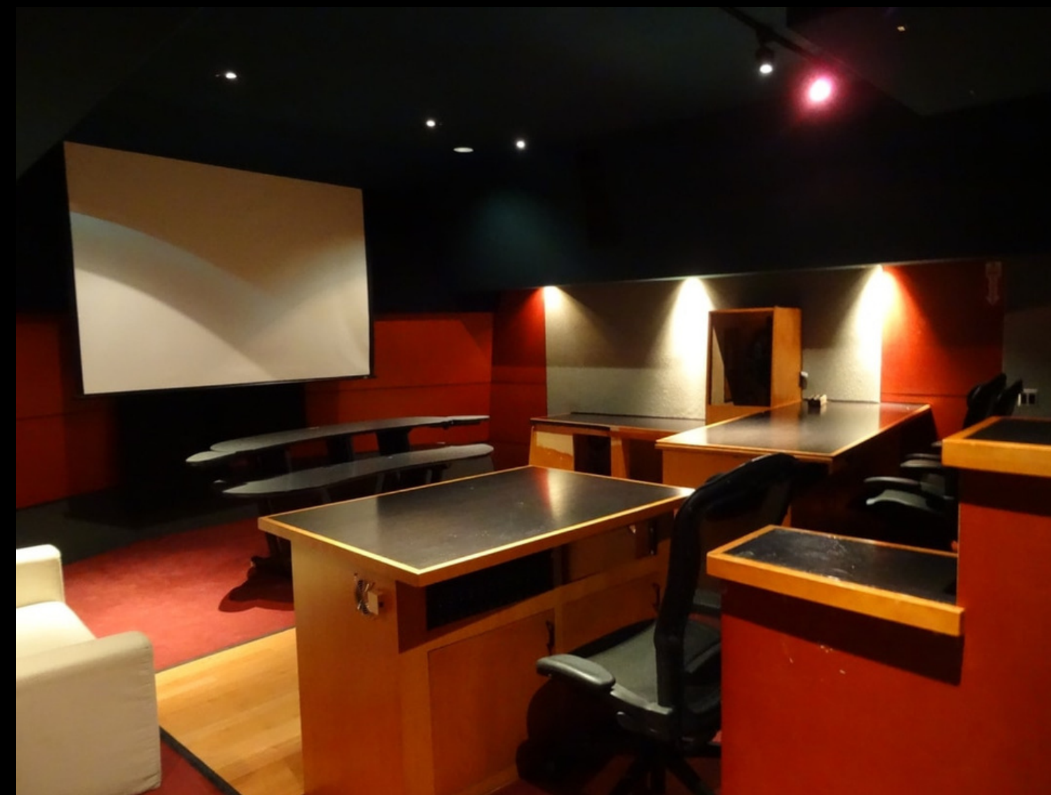
ORIGINAL WOOD PANELS STUDIO RENTAL