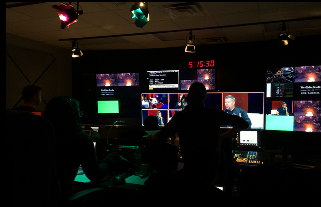
Main Control Room both green screen stages have the ability to connect to our main control room.